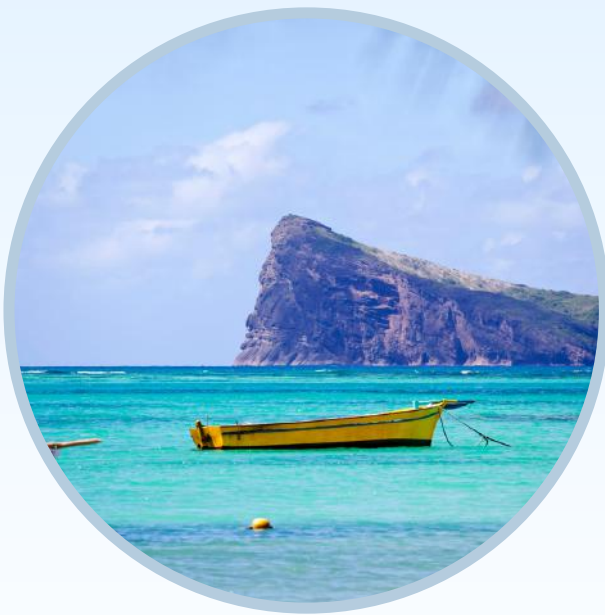
Full Day North Tour