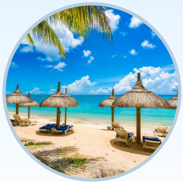
Full Day South Tour