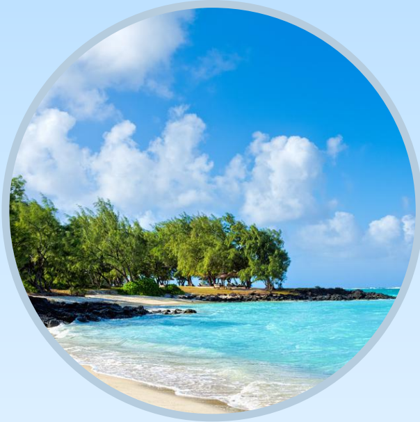
Full Day Ile Aux Cerf Tour with speed boat transfer